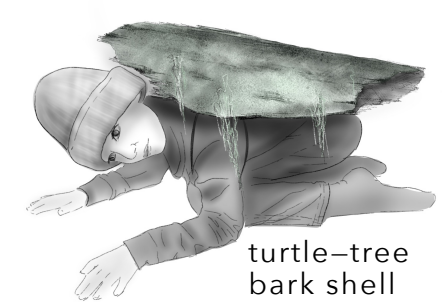
turtle-tree bark shell

Iya The Devourer legs—branches and non-native species, oriental bitter-sweet, which grows rapidly, shading out the vegetation that supports it, and girdling trees, cutting off the flow of water and nutrients, making trees particularly vulnerable to damage from ice and wind; body—choreographed students, black cloth