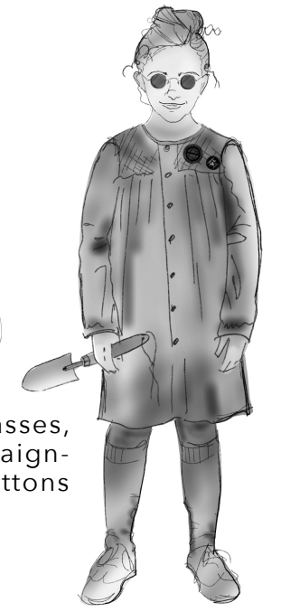
mole-glasses, trowel, campaign-style buttons